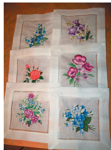
• 703 Floral Doilies